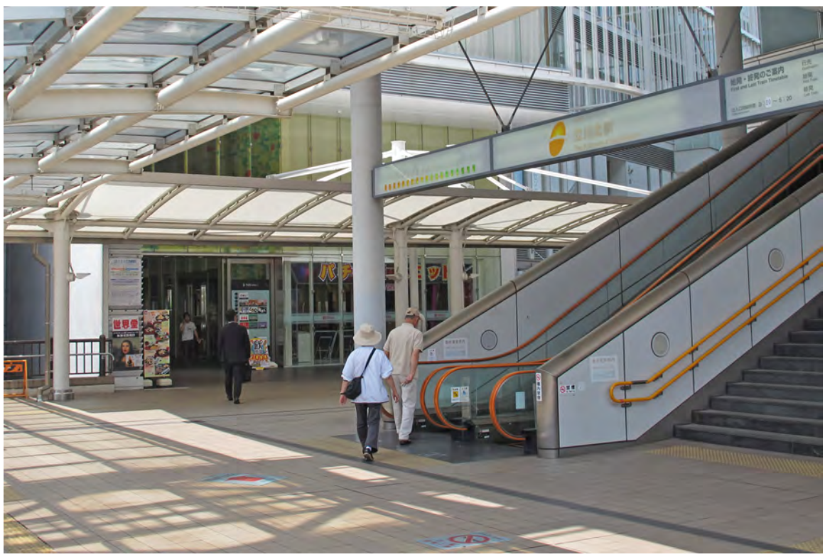
monorail station escalator