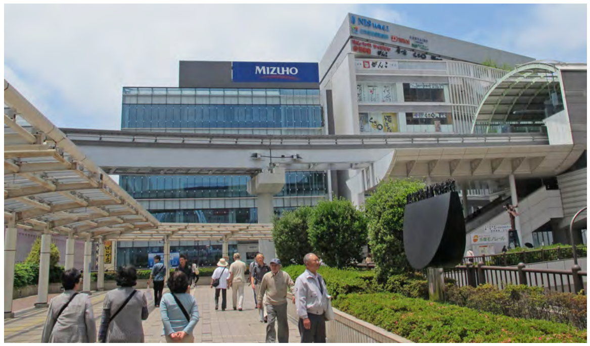
looking west across the plaza