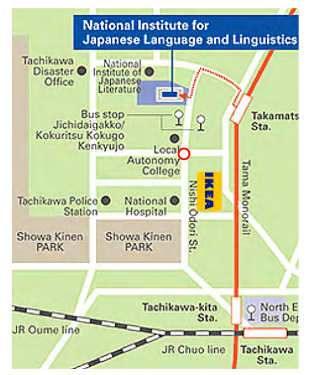
National Autonomy College intersection