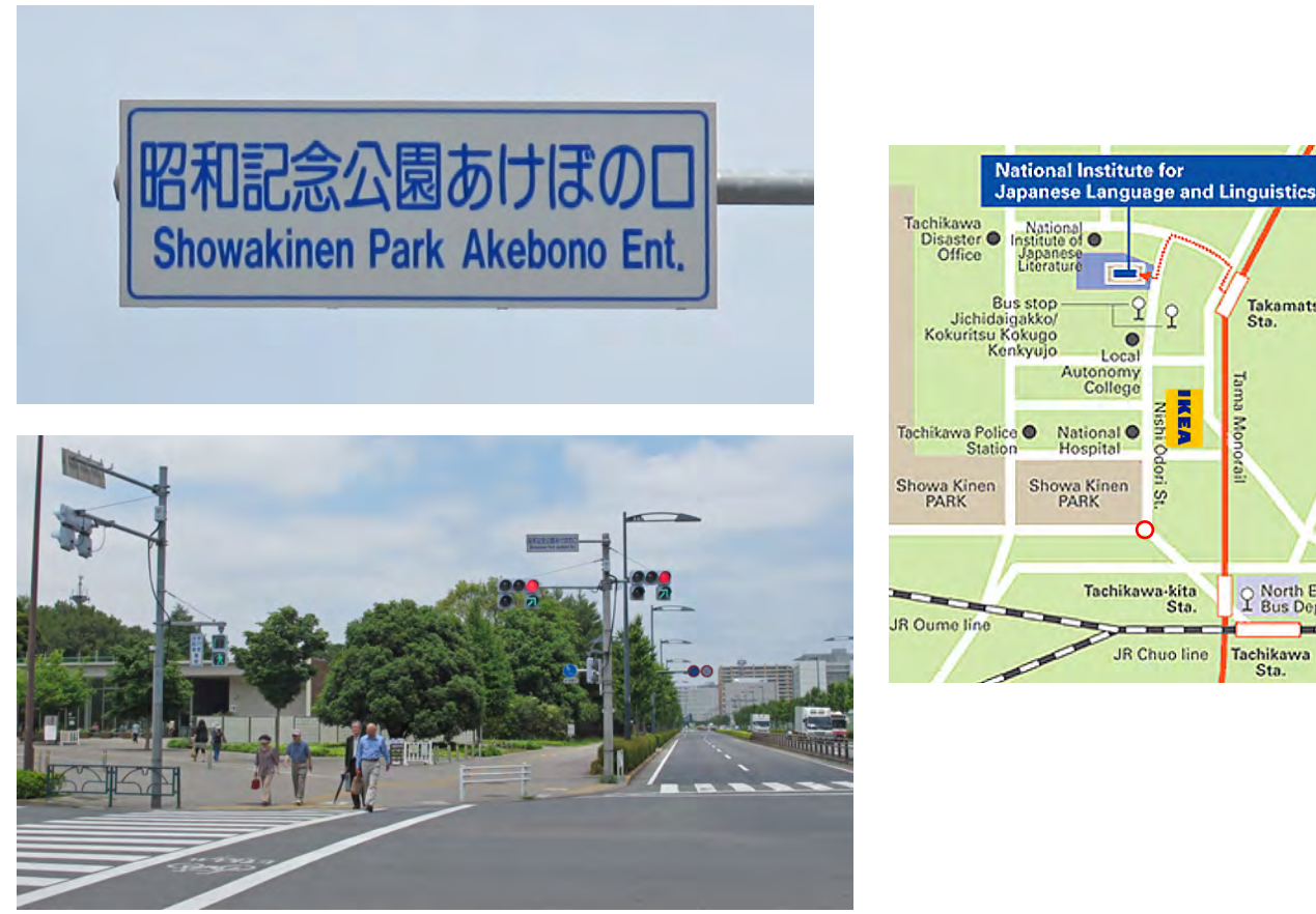
Showa Kinen Park intersection