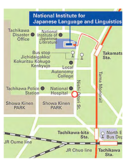
National Hospital intersection