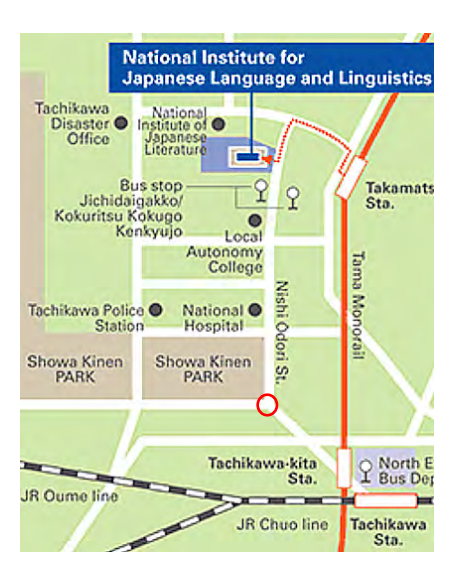
Shōwa Kinen Park intersection