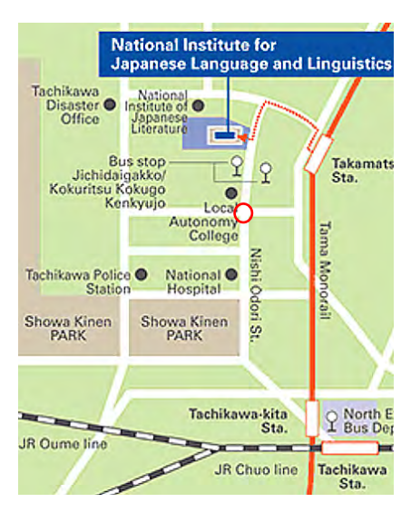
National Autonomy College intersection