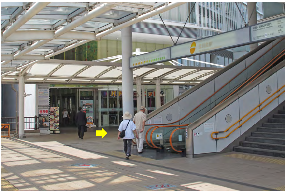
monorail station escalator