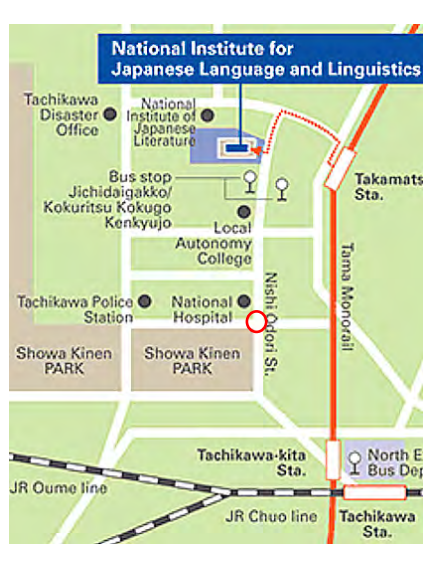
National Hospital intersection