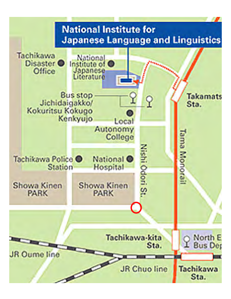
Shōwa Kinen Park intersection