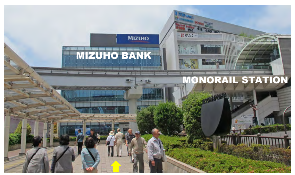
looking west across the plaza